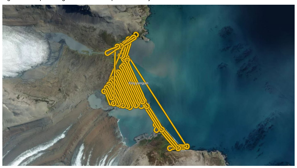
Figure 2. Flight path from the survey of St Andrews Bay which captured both the elephant seal and king penguin colony's. This flight was possible due to BVLOS permissions, taking a total of 56 minutes during which the eBee X flew 42.8 km.

Output 2 has been completed with the success of an extended field season over December 2021 and January 2022 and a final season (focussed on southern elephant seals) in October 2022. Fourteen sites were surveyed representing all of the main species we were aiming to target over this time period (Gentoo penguins, Antarctic fur seals, king penguins, southern elephant seals and wandering albatross), several of these sites were flow multiple times during different seasons in order to survey different species (Activities 2.3 - 2.6).